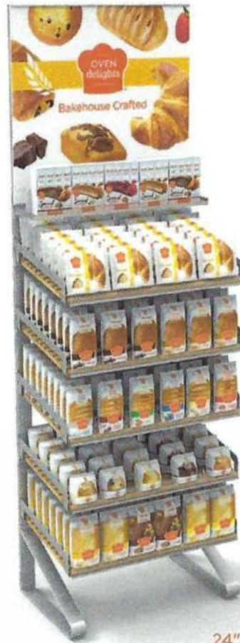
24" Floor Display

Contact a sales representative for additional merchandising program details.