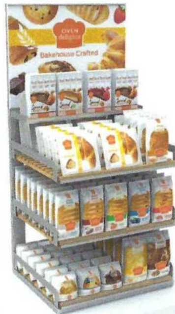
19" Counter Display